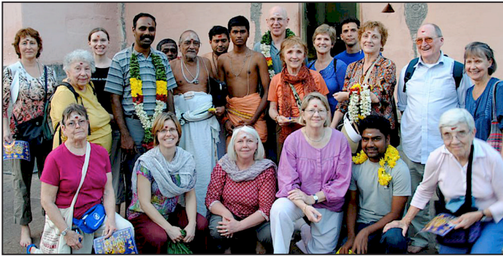
2011 Pilgrims with Temple Priests after Evening Puga in Thiruvannamalai